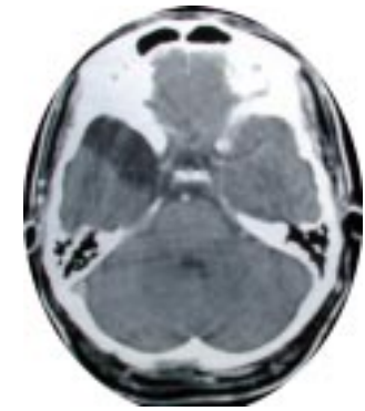
Cat scan of Brain showing Right Sylvian Arachnoid cyst (dark area on left of picture)

If a blood vessel crosses the cyst this may bleed and cause collapse. A small injury to the brain may cause this and at other times it may be spontaneous.